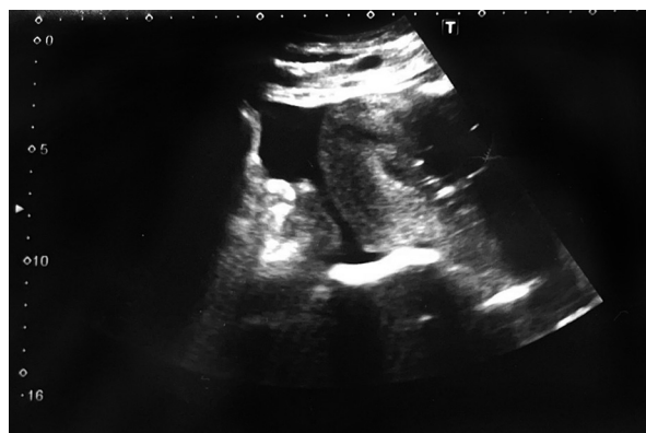
Figure 2. Postoperative ultrasound image of minimal free intraperitoneal fluid collection Slika 2. Ultrazvučni prikaz kolekcije minimalne slobodne intraperitonealne tečnosti postoperativno

During the following days of hospitalization, the mother's general condition was stable. She was treated with blood derivatives, thromboprophylaxis, antibiotics, uterotonics, and supportive therapy. Postoperatively, the patient received a total of 3 units of resuspended red cells and 1 unit of fresh frozen plasma. The ultrasound showed a collection of minimal free intraperitoneal fluid ( Figure 2 ). Pelvic drainage comprised 10 - 100 mL of serous blood daily and was removed on the fifth postoperative day. The microbiological smear of the uterine cavity taken during cesarean section, and hemoculture and urine culture came back negative. The histopathology examination of the placenta showed small foci of inflammatory