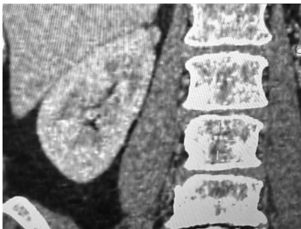
Figure 1. Renal mass on the upper pole, contrast-enhanced CT scan

CT – computed tomography SMA – smooth muscle actin